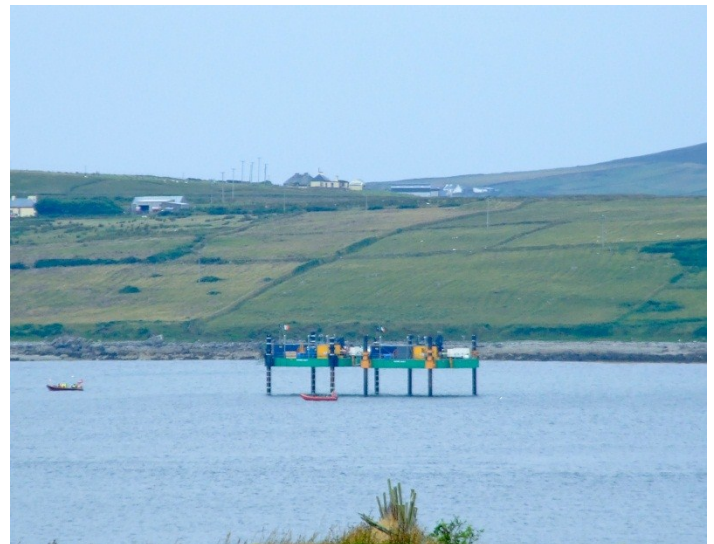
** Pictures depict the combifloat units used in Self Elevating Platform Mode**